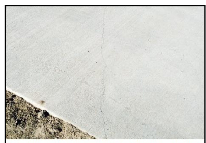
The photo above is an example of a hairline crack, which is not covered, unless the opening is wider than 1/4"

The Builder warrants a minimum slope (grade) away from the home of 5% in the first 10'-0" (or 6" drop). When there is less than 10'-0", it will still remain at the 5% minimum slope. The Builder will then grade the lot to