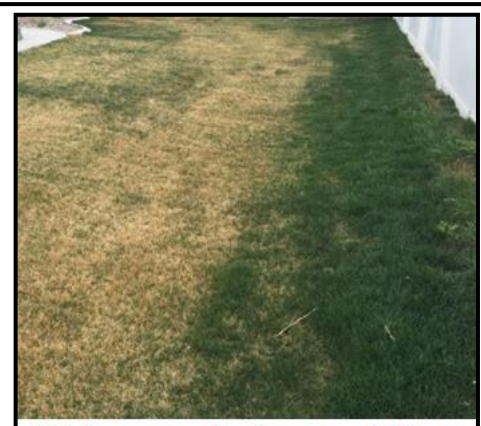
This is an example of a proper drainage. Any dis-satisfaction with the slope of grading to allow the drainage is not covered under the Builder's Warranty.

allow water to drain as directed by city code, typically to the city outlined retention areas. These criteria will be met within the limits of practicality. Lot configurations sometimes make drainage requirements impractical.