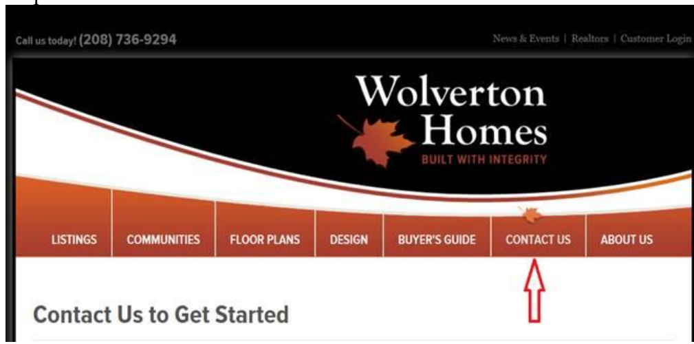
Step 3: Click on "Warranty Request"