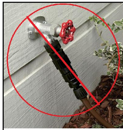
Example: Pipes that are frozen due to not detaching hose from the outside faucet will not be covered under the Builder's Warranty.

All roofing materials (shingles, shakes, and tile) are covered under the manufacturer's warranty. The Builder warrants against leaks caused by improper installation, flashing, or sealant for one year. Excessive wind/weather damage or acts of God are not covered under the