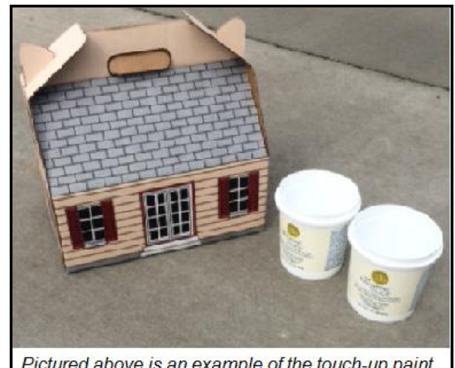
Pictured above is an example of the touch-up paint kit you will receive.

lacquers on woodwork is covered for up to one year, except in the event of water damage. On wood backsplashes, the Buyer is responsible for maintaining a good caulking seal to prevent moisture from entering the wood. Should this seal be broken, any deterioration and discoloration will be the responsibility of the owner. Damage (i.e., nicks around drains or the perimeter of the sink) to the painting of the home during or after move-in is the responsibility of the owner.